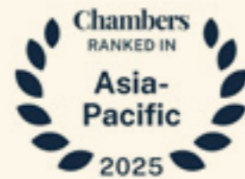
The firm was featured in the Chambers Guide in the Corporate/M&A Category in 2024 and 2025