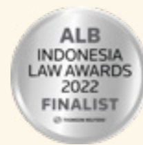
The firm was nominated as a finalist in Indonesia Law Awards by Asian Legal Business